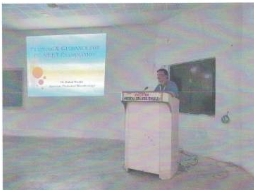
Program on Training & Guidance for PG NEET Examination

○ Ph.No.: 02562 - 276317,18,19 Mob. 9886505839