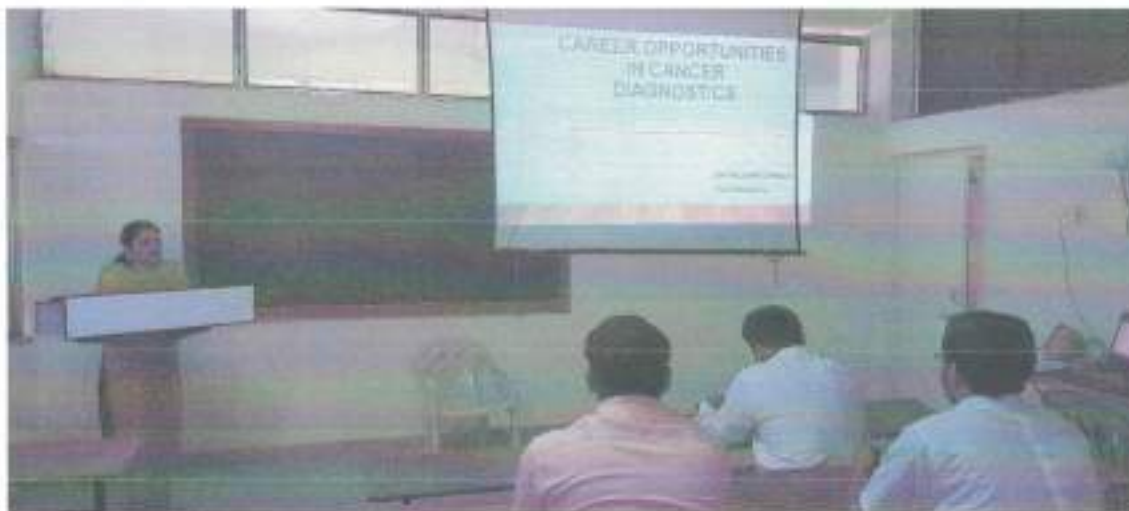
Career Opportunities In Cancer Diagnostics

Ph. (02562) 276317, 18, 19 Fax : (02562) 276027 e-mail : acpmcdhule@gmail.com web : www.acpmjmf.com