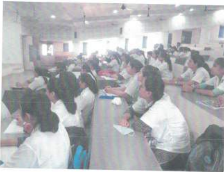
Awareness About Fellowship Programs In Foreign Countries