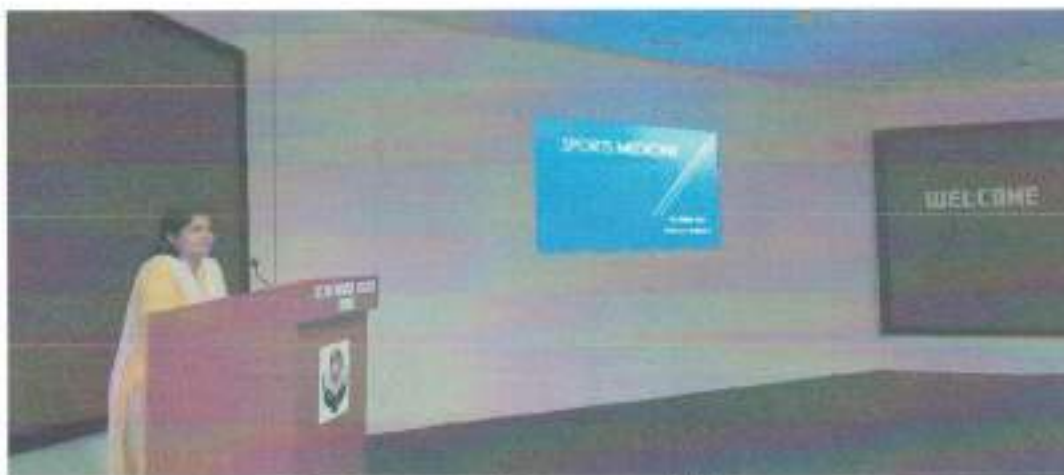
Program On Sports medicine

☎ Ph.No.: 02562 - 276377, 10, 19 Mob. 868585839