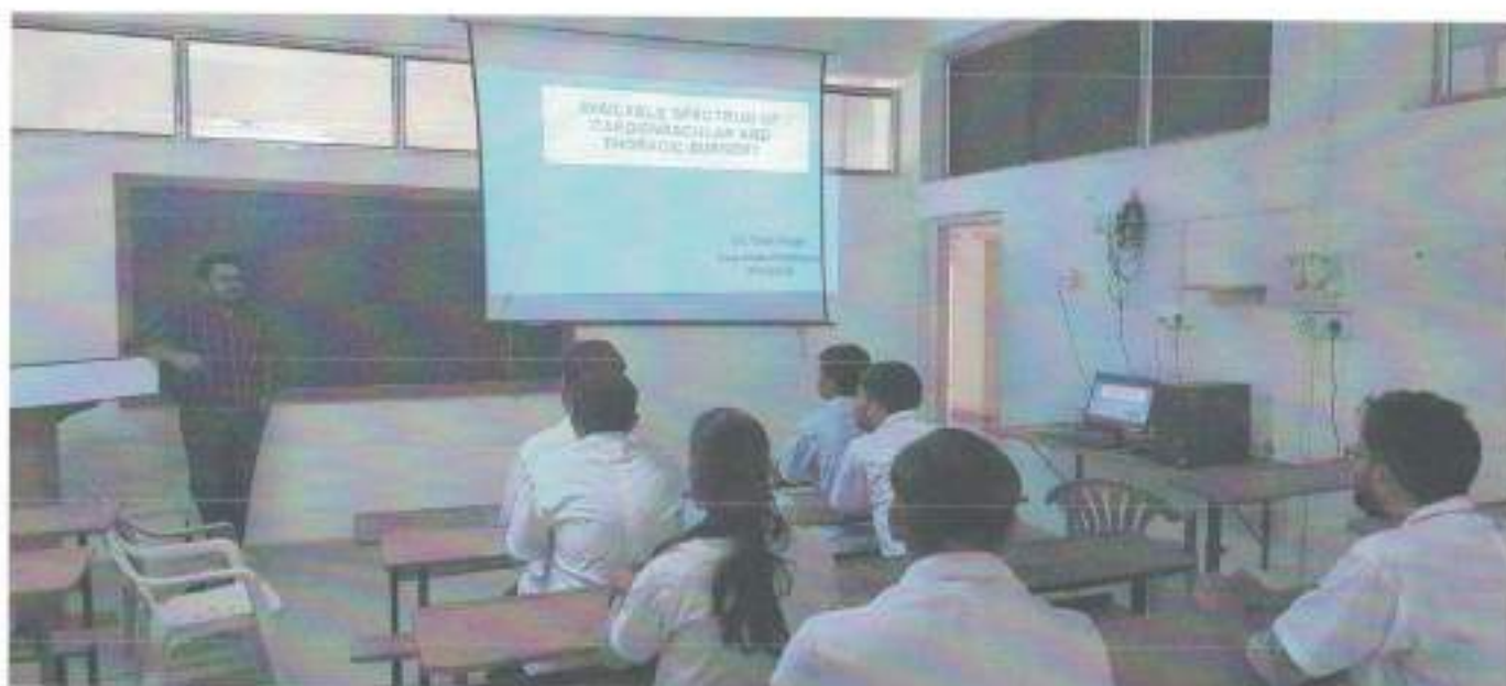
Available Spectrum of Cardiovascular and Thoracic Surgery

📍 Sakri Road, Dhule - 424001 (Maharashtra) ☎ Ph.No.: 02562 - 276317,18,19 Mob. 9686585839