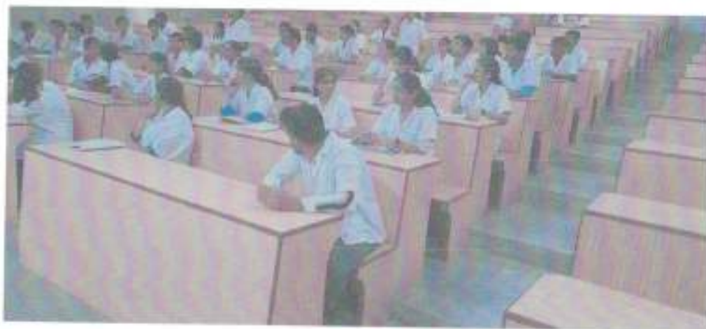
Program on Career Opportunities in Hospital Administration