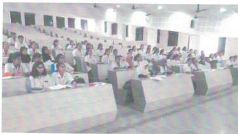
Job Opportunities in Overseas